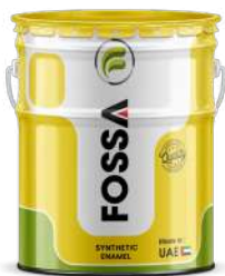
0.9, 3.6, 18 Litre