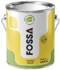
3.6, 18 Litre