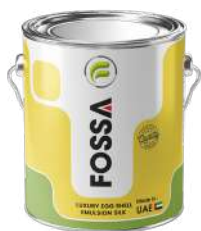
3.6, 18 Litre