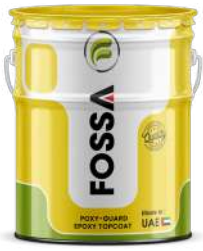
3.6, 18, 20 Litre