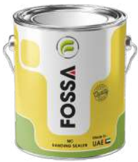
3.6, 18 Litre