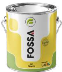
3.6, 18 Litre