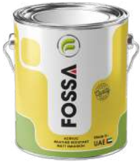
3.6, 18 Litre