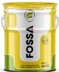
3.6, 18, 20 Litre

Anti-corrosive Mid-coat with excellent abrasion resistance