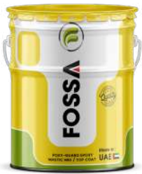
3.6, 18, 20 Litre

Possess excellent adhesion on blast-cleaned steel