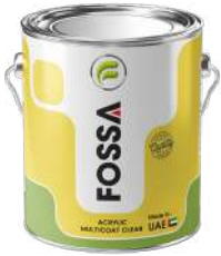
3.6, 18 Litre