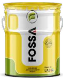
3.6, 18, 20 Litre