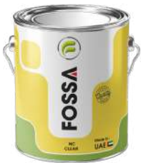
3.6, 18 Litre