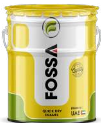
3.6, 18, 20 Litre