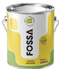
3.6, 18 Litre