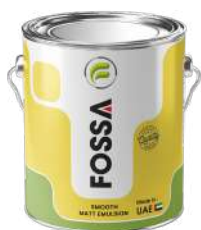
3.6, 18 Litre