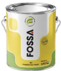
3.6, 18 Litre