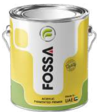
3.6, 18 Litre